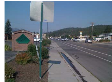
Looking West down Donner Pass Rd